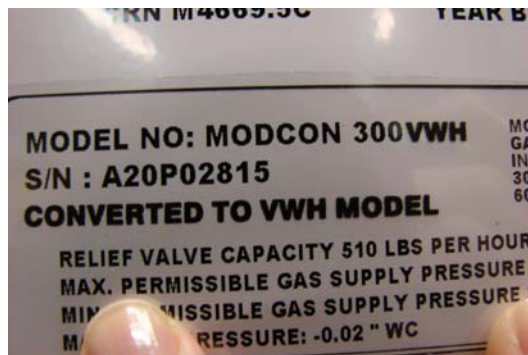
Fig. 2 Place clear VWH Label on ratings label as shown