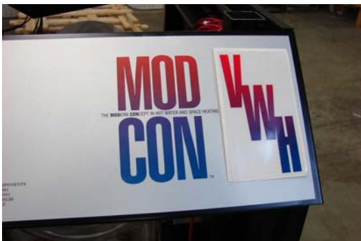
Fig. 1 Place log near Mod Con Logo as shown